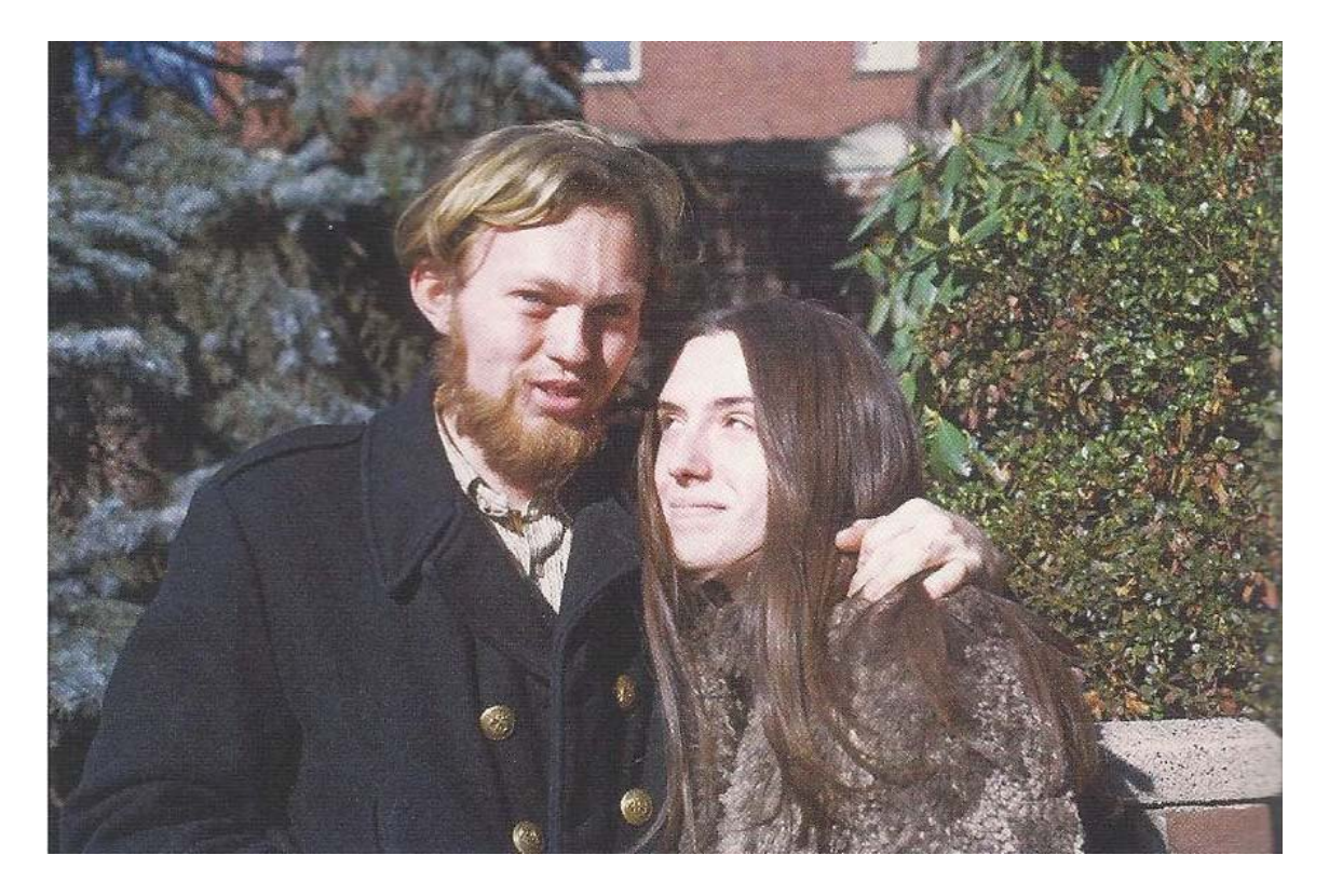
RISD Alumni Magazine, Fall 2014

Cade Tompkins Projects 198 Hope Street Providence Rhode Island 02906 www.cadetompkins.com cadetompkins@mac.com Telephone 401 751 4888